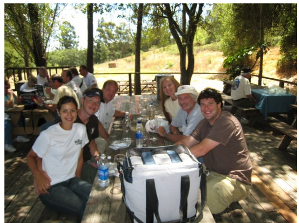
A group shot at the vineyards

I guess I could go on and on - but this should give you an idea of our 'encounters'. There seems to be 'characters' at every corner, and you can't help but enjoy meeting them along the way. There are so many people that have a story to tell about their MG, it is just fascinating to listen.