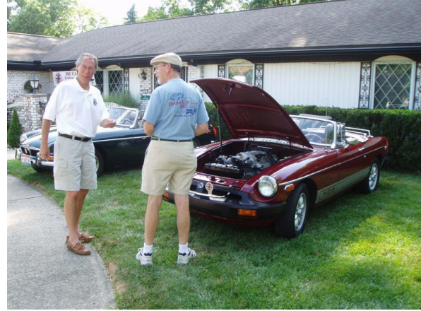
“Something still doesn’t look right under the bonnet.”