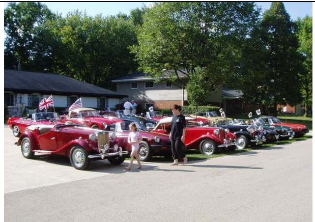
And again, neighbors stopped by to admire them.