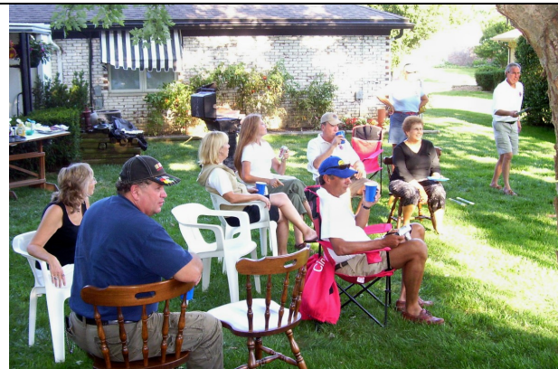
Members cheer on their favorite players in the exhilarating Aunt Sally competition.