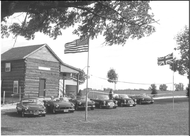
MGs lined up at "Ole English" Brit Bikes Museum, with Stars and Stripes and Union Jack flying.