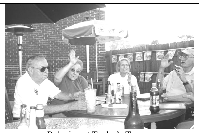
Relaxing at Taylor's Tavern