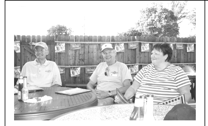
Relaxing some more at Taylor's Tavern.