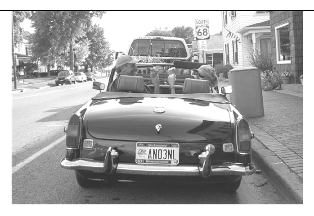
Dave & Lois Gribler's Ice Cream cones and MG-Too Cute!