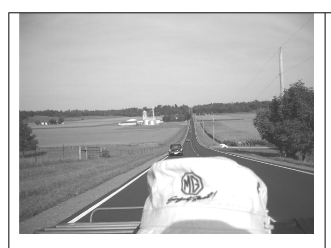
Line of MGs a seen from the leader.