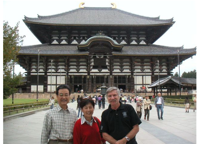
Seeing the sights in Osaka