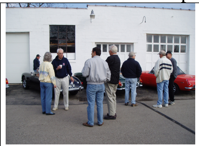
Tune-Up Clinic starts with customary shop-talk in the street before getting to work