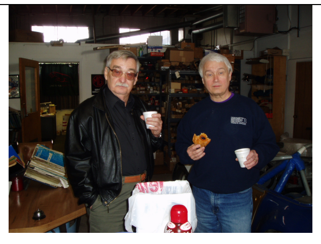
"Get to work? Then the donuts would go to waste!"