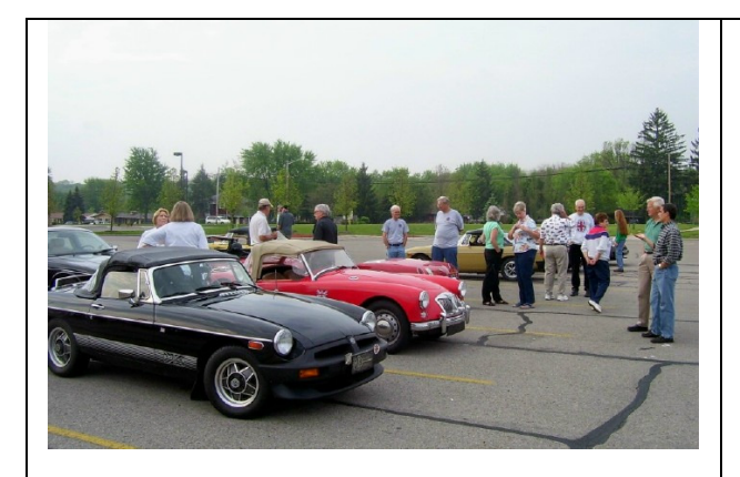
Assemblying before the drive to D&D Classics