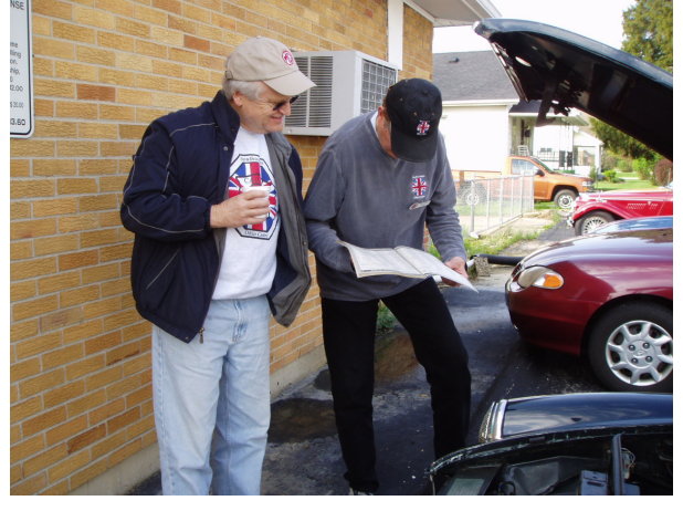
When all else fails, read the manual.