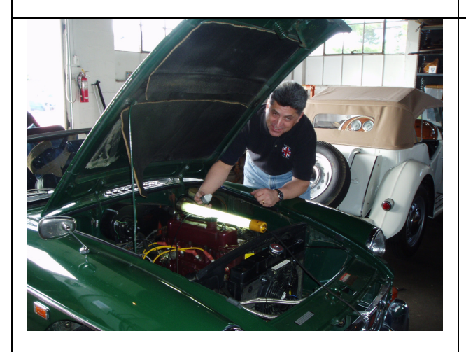
Some members actually worked on their MGs