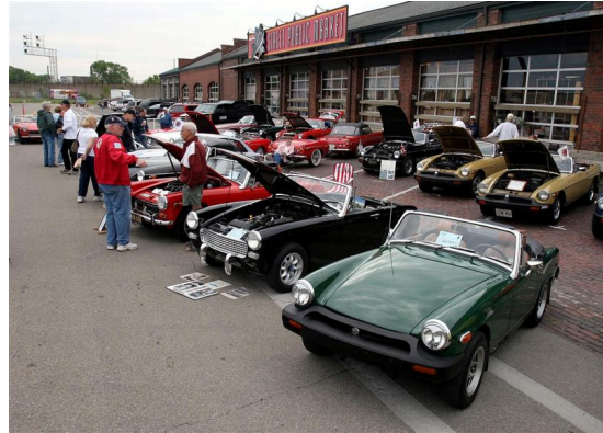
And Plenty of MG Midgets