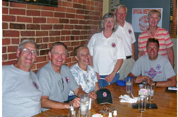
Enjoying lunch after the drive.