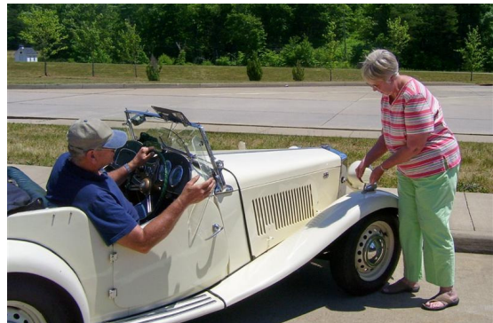
How they did it before power mirrors were invented.