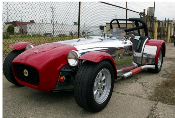
A Lotus 7