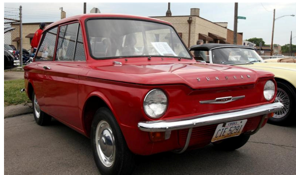
A Sunbeam Imp