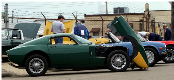
Best of Show was a Triumph 4A