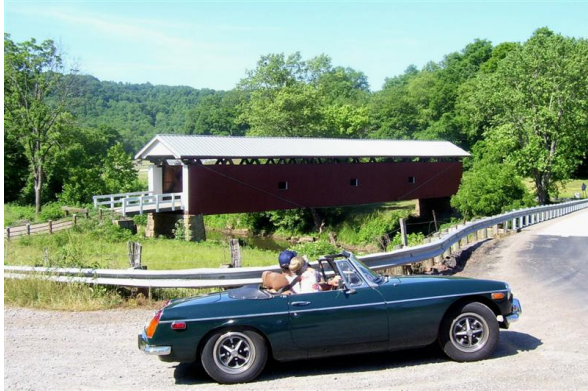
What's this? A covered bridge?