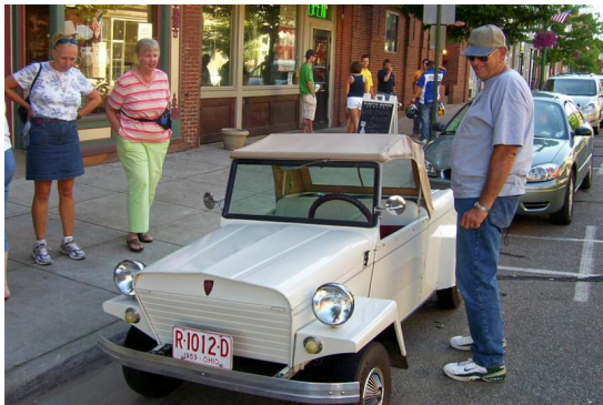
Running into a King Midget tour in town.