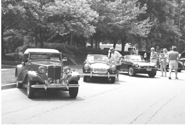
Three MGCCSWOC members' cars on display.