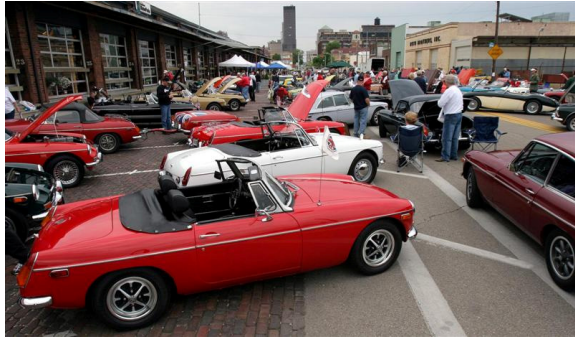
Plenty of MGBs