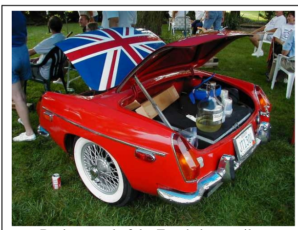
Business end of the Zeno's beer trailer