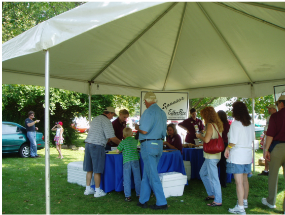
Everyone's favorite stop, the Esther Price tent! They didn't mind my sampling for all the club members that didn't make the show.