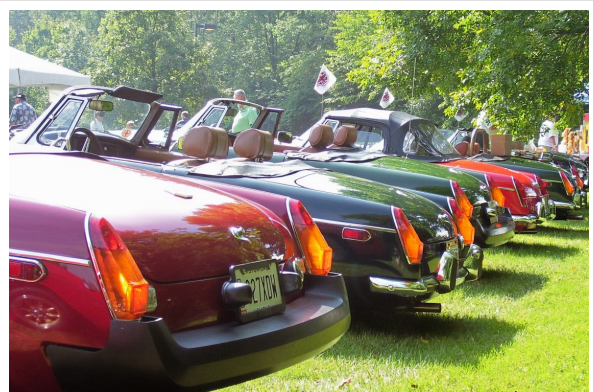
MGBs, all belonging to club members who were volunteering, created their own show.