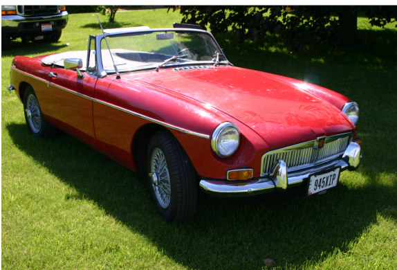
Dick Kaczmarek's restored 1965 MGB