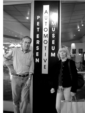
exhibit of Steve McQueen's autos. His Jaguar XKSS, the street version of the D type Jag, was worth the price alone (see picture below). He also owned an MG TC (see below). Not to mention his clapped out daily driver Mini, his many Porsches, a bunch of Triumph motorcycles, the Mustang from Bullet. Great display, but they also have tons of street rods, antiques, an old gas station, a Ford showroom from the 30's etc. It's well worth a couple of hours wandering around. I've included a couple of photos.

But we did visit the Petersen Automotive Museum, and that is definitely worth the $10 admission. The Petersen family, that founded Hot Rod magazine and created an automotive publishing empire, funds it. The museum was born upon sale of the publishing company. Three stories of all kinds of automotive history. Featured right now is an