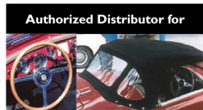
Authorized Distributor for Pertronix Electric Ignitions and Coils

By being an online based company, we are able to keep costs low and maintain a flawless ordering system that is quick and user friendly. We have the parts for most British marques and models as well as fun collectibles and other useful items for the British car enthusiast. Log on to www.LBCarCo.com and see why we excel at what we do.