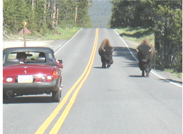
Ryan's MGB passing 2 buffalos