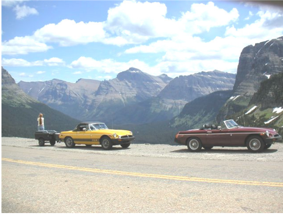
The Looft MGs in Glacier National Park