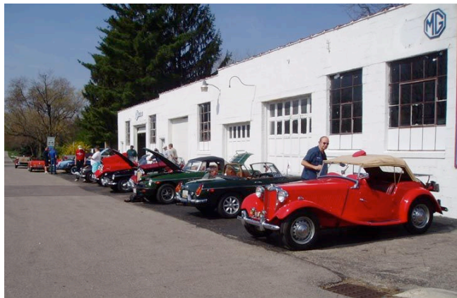
Look at all those MGs!!!