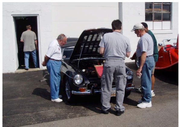
Club members confer on a problem.