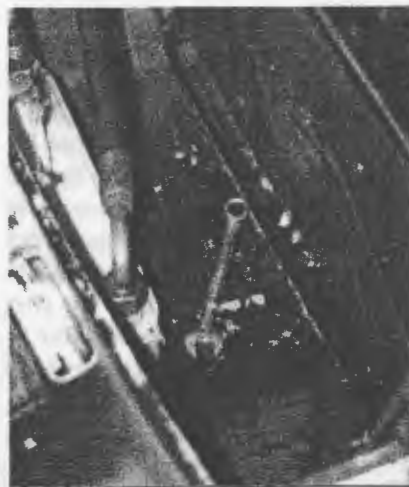
Guess who drove to the tune-up clinic with this wrench under his hood?