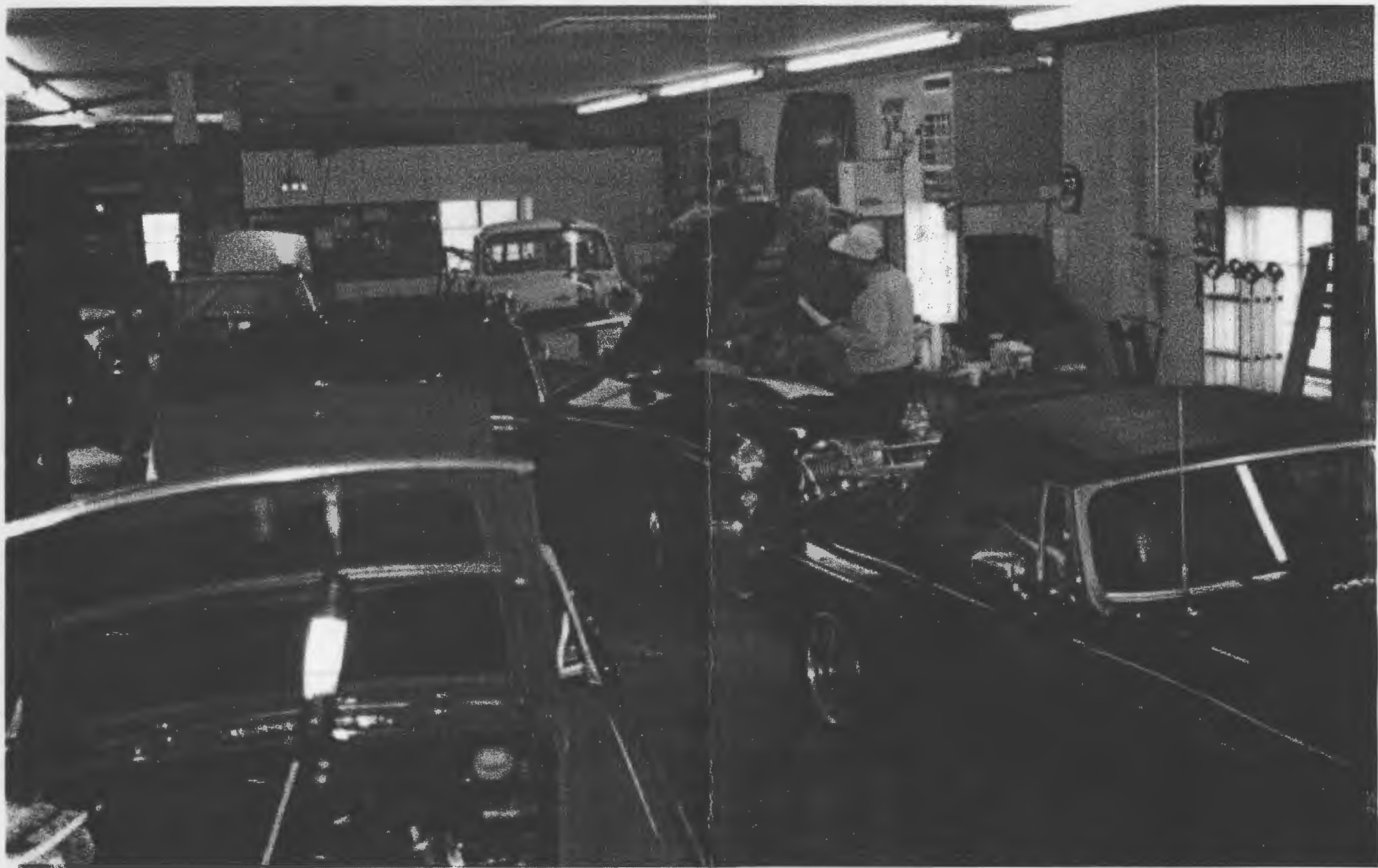
Five, countem, five MG's and two minis inside Matt Schneider's huge well lighted garage.