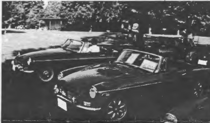
MG'S were well represented at British Car & Cycle Day '96'

In the booming Eighties, the business mushroomed, winning three Queen's Awards for exports and spreading the message about British design around the world. But it was hit hard by the