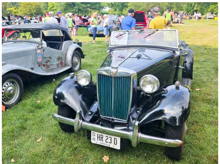
BCD Dayton 2023