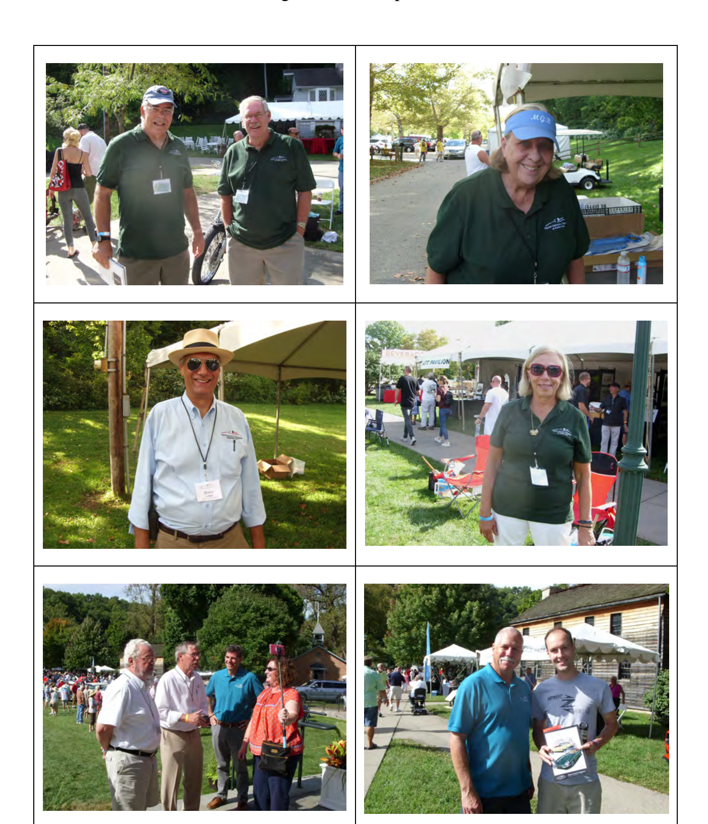
Thanks to Skip and all the volunteers for another great show!!