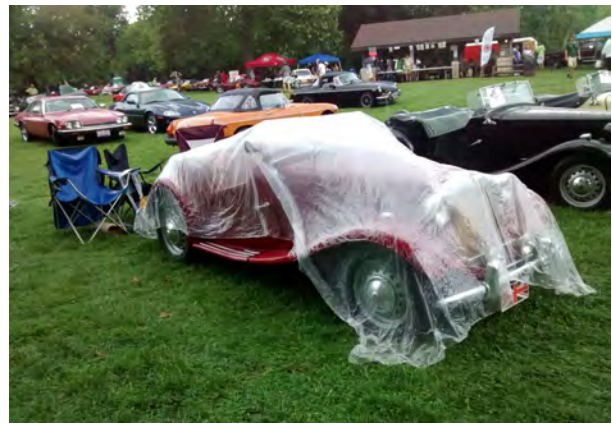
A not-so-nice ending to an otherwise beautiful day.