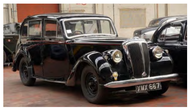
they know about it.

red leather upholstery and a license plate.