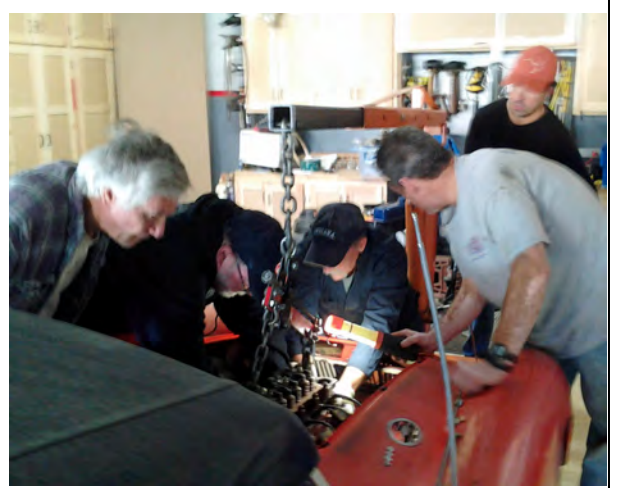
Isn't this what being in a club is all about?