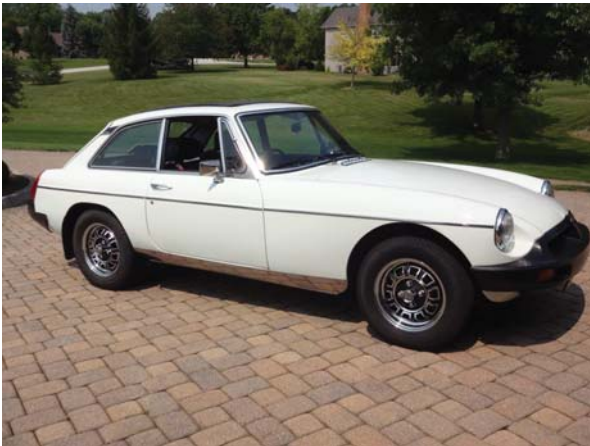
The V-8 is getting very close to being finished!!

Stay dry and we'll see you at the meeting.