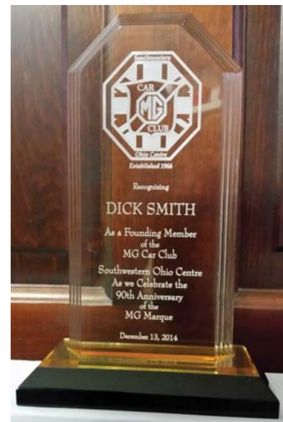
Close up of one of the awards.