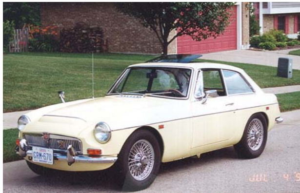
1969 MGC GT

wood rot since it had always been in the southwest. It came back home with us to Dayton in 1963.