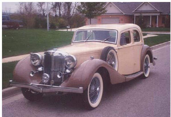
1939 MG WA Sedan

Favorite car restored for others?—1939 MG WA Sedan, restored after five years of work for a friend in Spring Valley, OH.