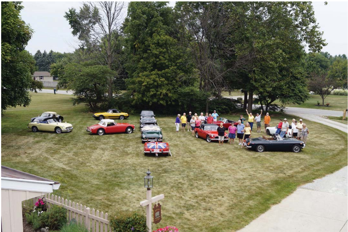
Club members' cars parked on the front lawn in the MG 90 formation...kind of, use your imagination.