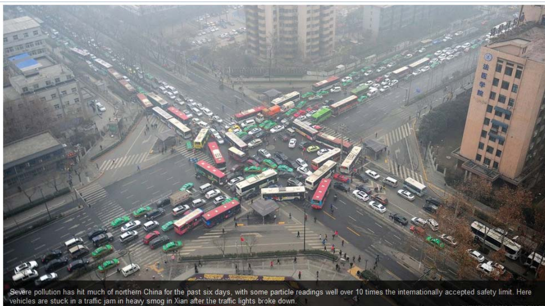
Severe pollution has hit much of northern China for the past six days, with some particle readings well over 10 times the internationally accepted safety limit. Here vehicles are stuck in a traffic jam in heavy smog in Xian after the traffic lights broke down.

Editor's Note – When's the last time you saw smog like that in the U.S...even in Los Angeles?