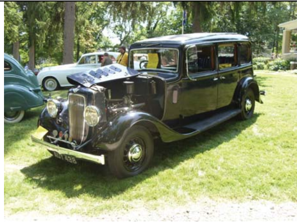
British Transportation Museum's 1936 Austin Mayfair