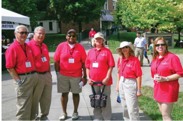
Club members take a break just long enough to get their picture taken.