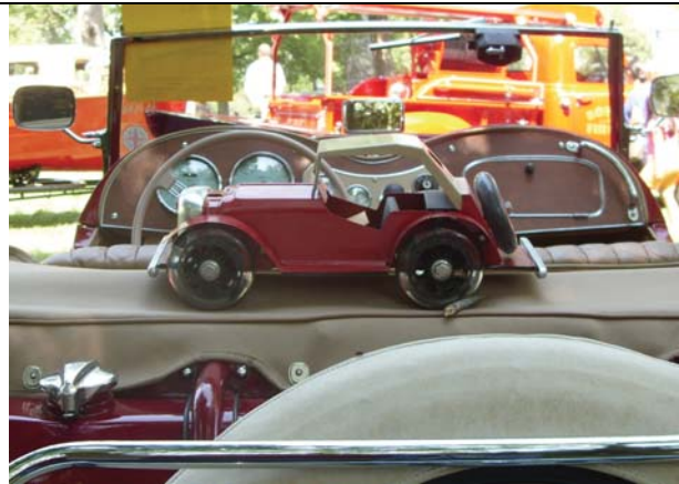
Joe Hooker's valve cover racer was there, too, perched on the back of Steve's TD!