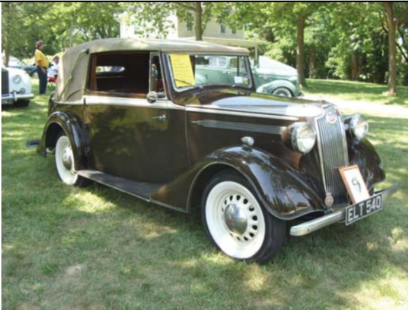
British Transportation Museum's 1938 Vauxhall Fourteen-Six