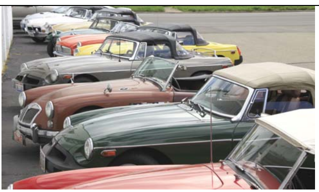
They look even better close up!