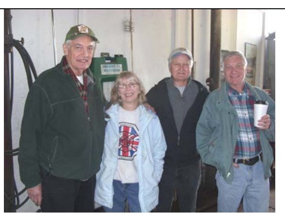
...or just came and had a good time.