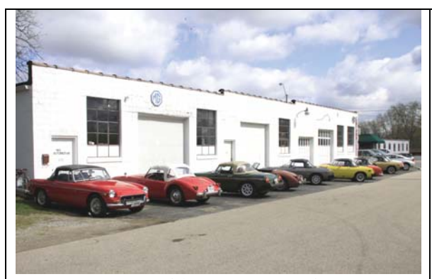
Cars outside MG Automotive.