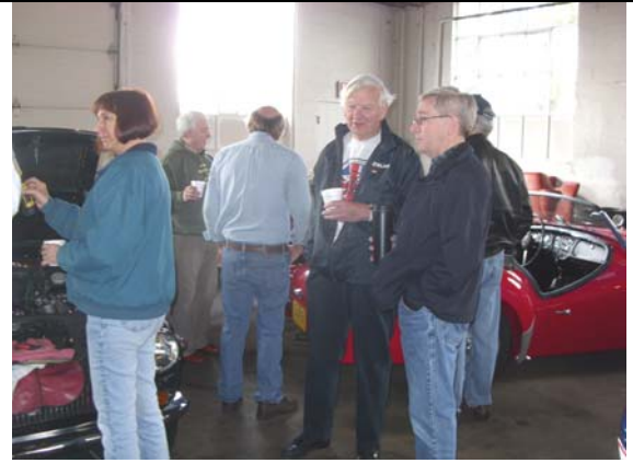
Most of us drank coffee and ate donuts...