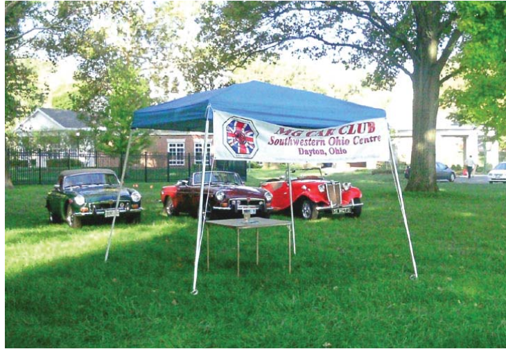
Some of the MGCC members' cars that were parked in a special parking area outside of the Concours car show.