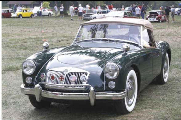
Louie DiPasquele - First Place in the MGA Class.