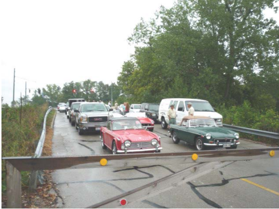
The day started with a locked gate, but then everything was downhill from there.