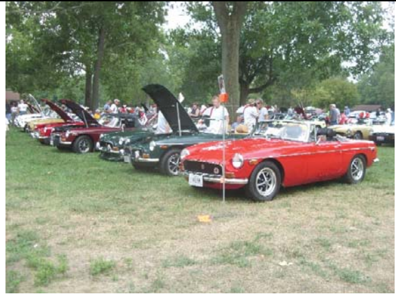
Lots of MGs