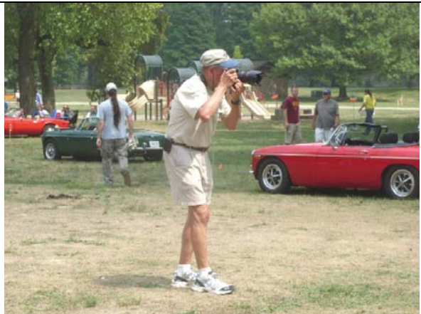
Ron Parks captured all the action.