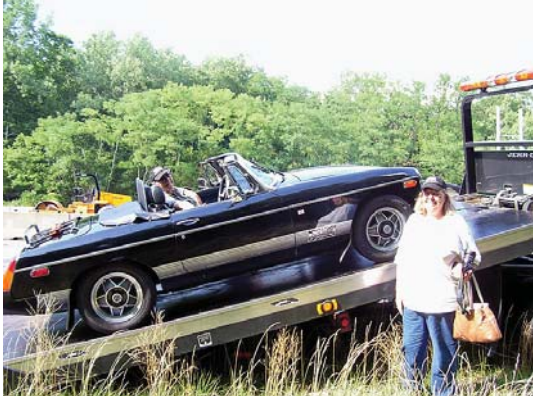
Sometimes, a fun trip to a car show doesn't work out the way you planned.