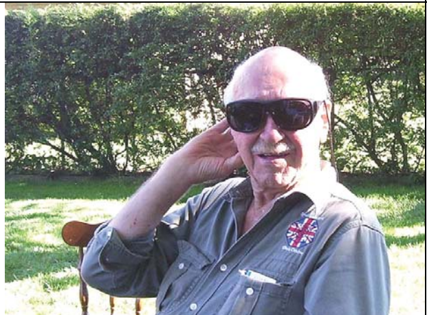
Relaxing in his own back yard at our annual club picnic.