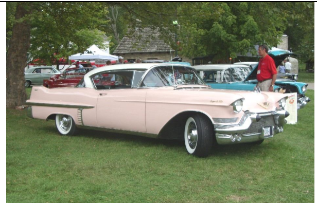
...and even a pink Cadillac

Editor's note – In past years I've shown photos of club members' cars on display at Concours and club members hard at work (and there always are a lot of us). This year I'm showing a selection of the cars and other vehicles on display at this year's show.