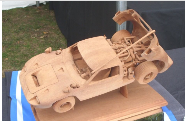
Wood race cars...