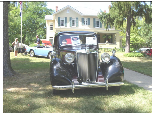
British Transportation Museum's MG YA