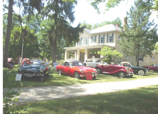
Couldn't have asked for a nicer day or location