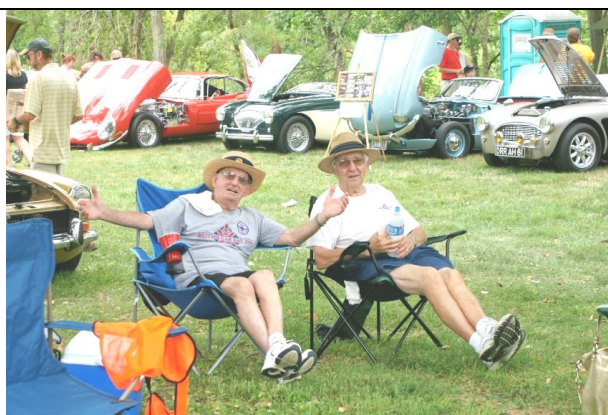
“Mamma Mia*-- is this a car show or what!!”