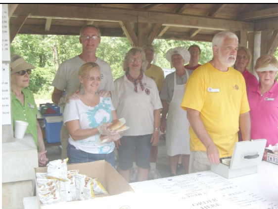
The concession stand workers kept everyone fed.