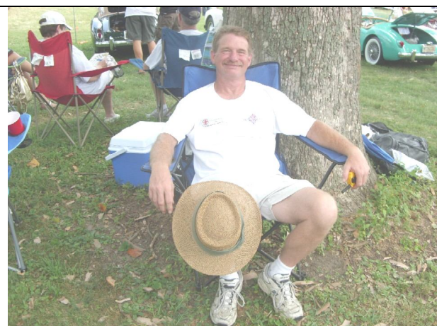
“They’ll never find me back here!”