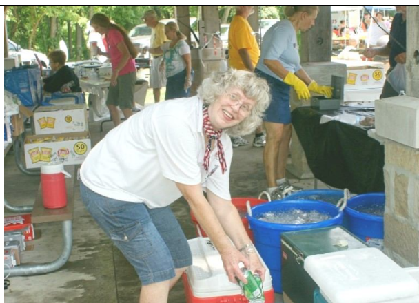
“Bad back? What bad back?”