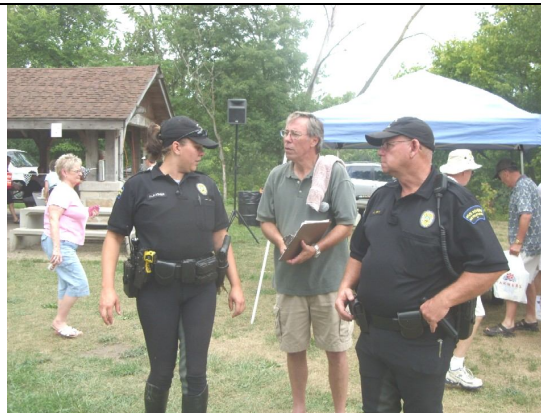
"But officers – I know I put enough money in the parking meter – honest."