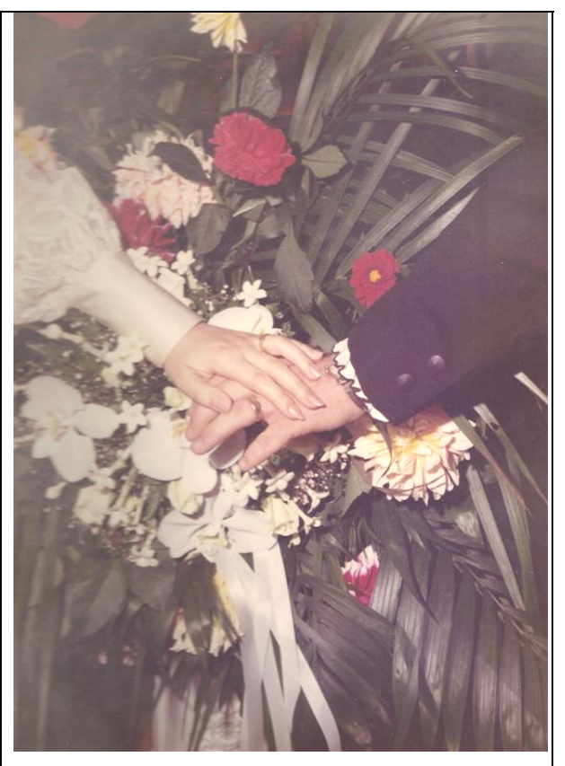
FOREVER YOUNG (and before dishpan hands)