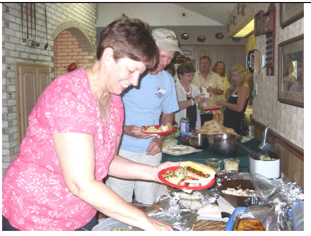
Lining up for food.