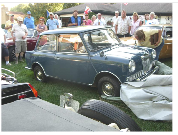
Mystery car revealed – 1968 Riley.