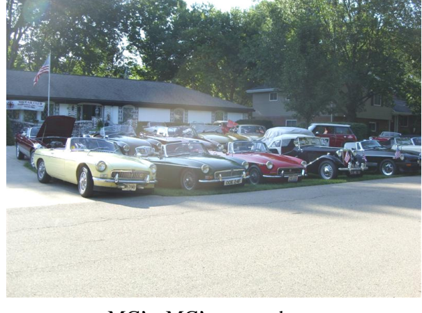
MG's, MG's everywhere.