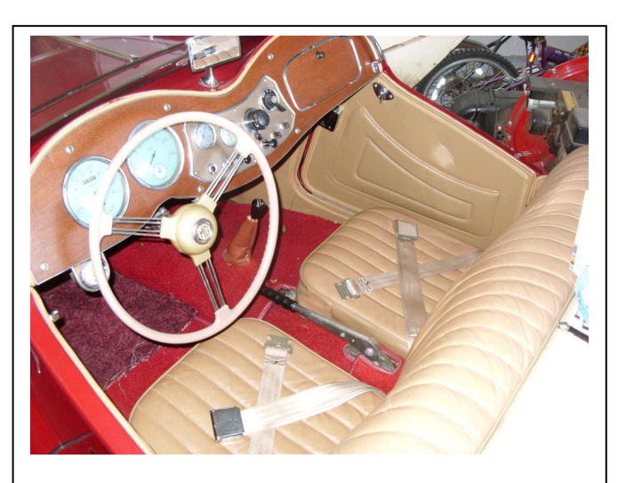
Seat belts neatly placed for display. Note the temperature gauge on the bottom of the dash, just left of the steering wheel.

While Doug had to replace the wood frame and interior with modern reproductions, all the sheet metal was original. The engine and transmission also were original, although having been overhauled over the years, which is to be expected. The engine and body numbers match. One of the things I liked about Doug's restoration is that it was very authentic. The only changes he made from original were installing red, instead of factory-