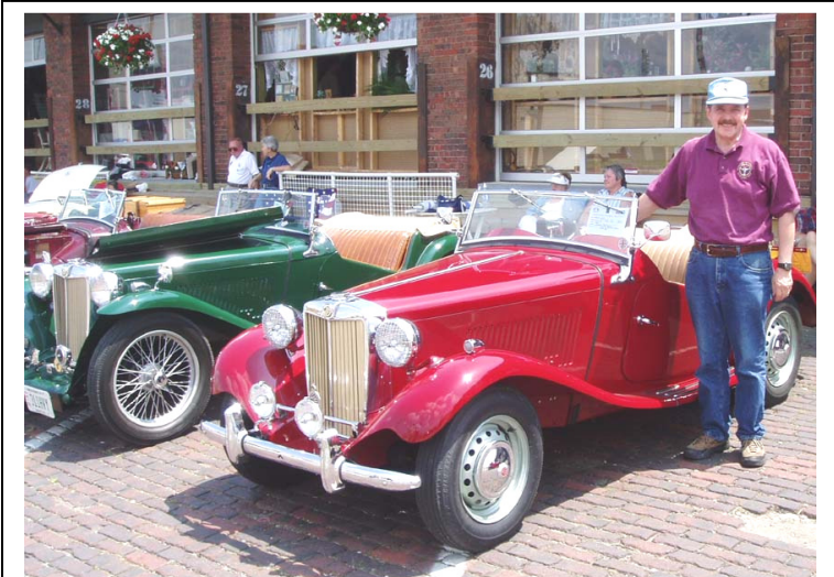
My favorite picture, taken at the 2<sup>nd</sup> St Market in May 2004.

TD, just that I've always wanted one. By the late 1990s, I started thinking seriously, not for a real one, but a kit car. I never realized that real TDs were both available and affordable, so was mentally planning out a five-year project to build a replica. After months of internet searches, I finally found the Canadian company that made the fiberglass conversion kits. I also found dozens of adds for TDs, and shifted my thinking away from a fake one to the real thing (BTW – I figured it'd cost me about $10,000 or more to build the kit version, but completed ones that were for sale seldom went for over $5,000).