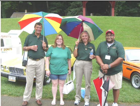
The Gribblers and Hodges keeping dry.