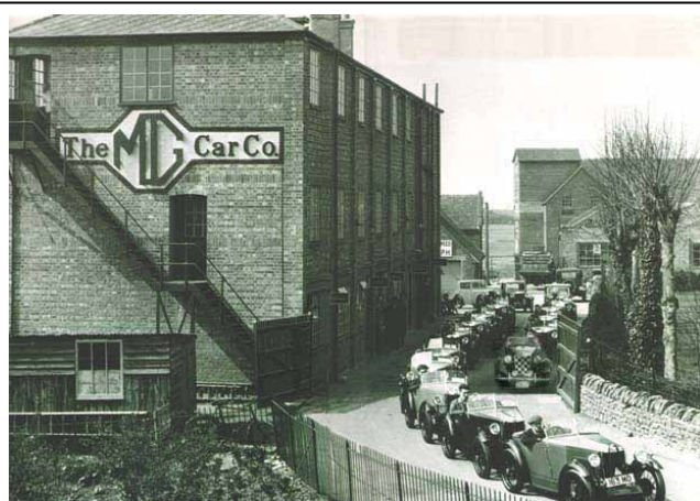
Same spot, about sixty years earlier.