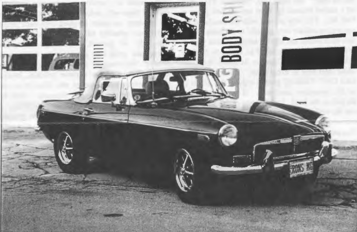
A picture is worth a thousand words. Ron's hard work speaks for itself!

Don't flush parts down the toilet. Yes, there is a story behind this. I will admit to it in this my last restoration update article. One day I was cleaning the under side of the car, specifically, the brake lines, fuel lines and power line from the battery to the starter. I had removed the rubber grommets that separate and secure these lines from the front to the back of the car. Near the front, there is a large half moon shaped grommet. Mine was in pretty bad shape, but I thought it was not available since it was not in the Victoria British catalog or at least I