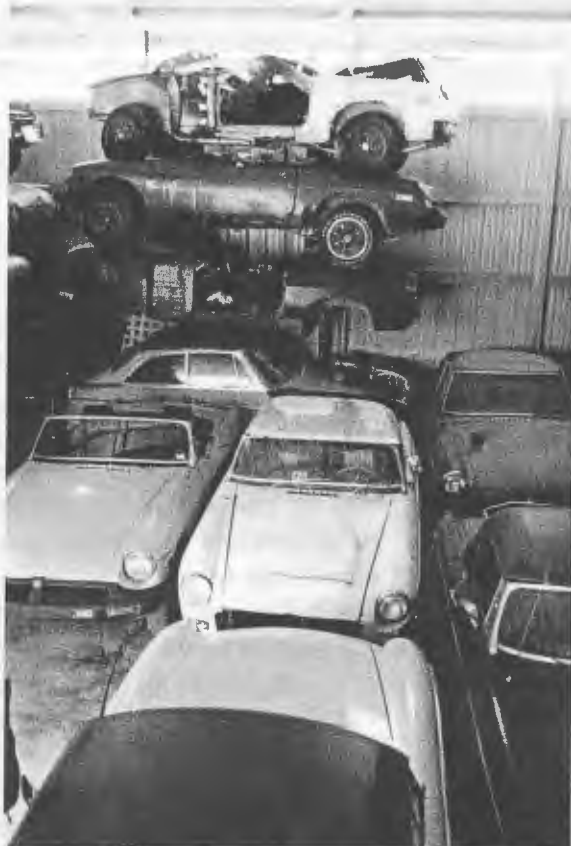
Inside the Looft's barn