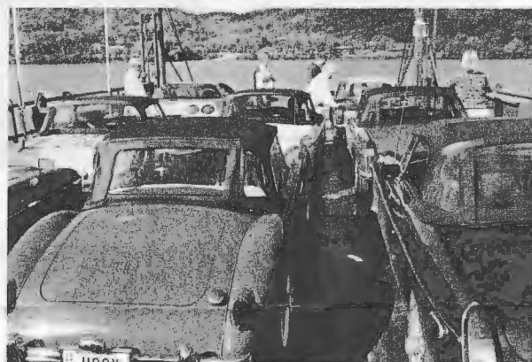
Crossing the Ohio River by ferry boat