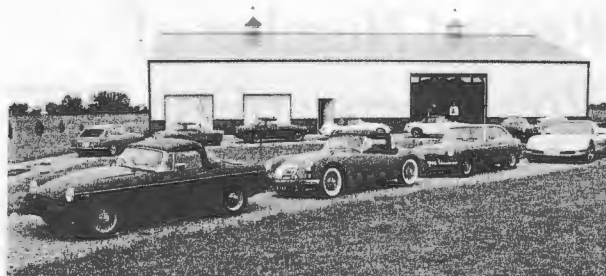
First stop - the Looft's barn