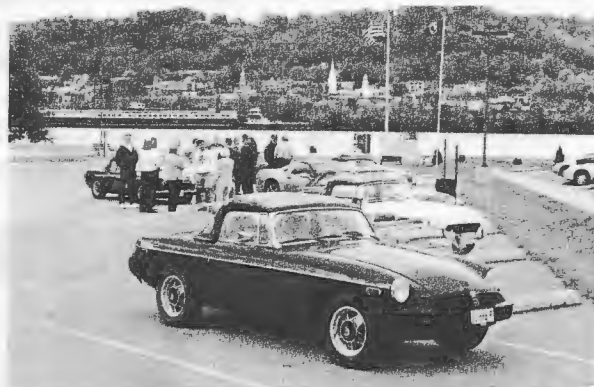
Rest stop on the Ohio side of the Ohio River

Augusta, Kentucky. Lunch then took place in Augusta at the Beehive Restaurant. The Augusta Ferry took the tour back across Ohio River into Ohio. Two trips had to be made on the ferry to get all the cars across. The drive continued along the Ohio River and up to Goshen, Ohio where a couple of cars were lost from the group due to an error in the directions, but were found shortly. The drive ended in Goshen early as it was starting to get late. Everyone seemed to enjoy a day out and in the MG. Thanks to everyone that participated