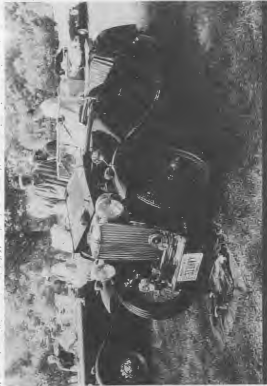
...and MGTs galore!