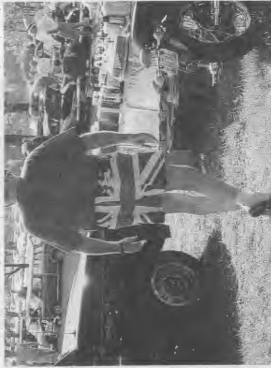
A British car enthusiast, no doubt.