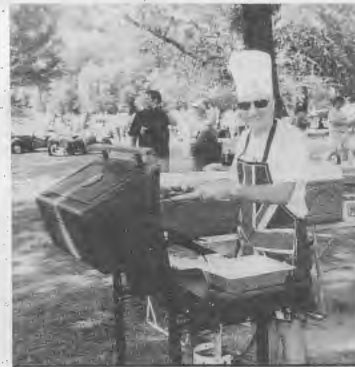
I'll take two unburnt ones, please.