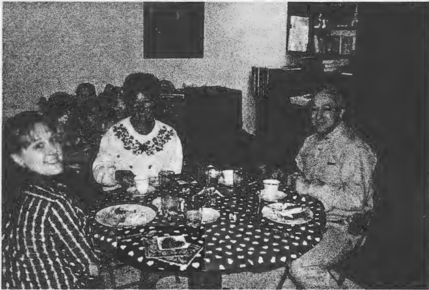
Valentine Party Photos By Terry Loof