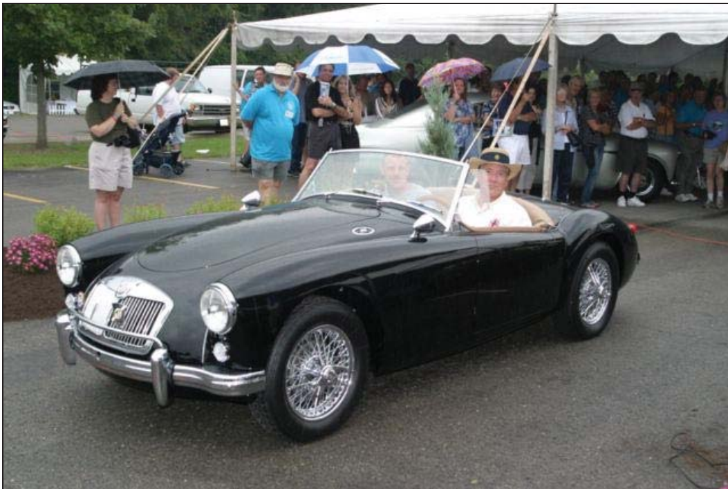
Dar Planeaux wins at Concours d' Elegance