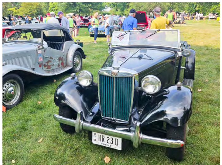
BCD Dayton 2023